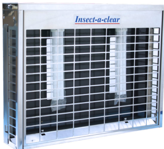
Actual size W 51 x H 38 x D 9.5 cm

With its unique 'thru board light technology' all the lamps can be seen from both sides of the machine, thus giving maximum attraction to flying insects.